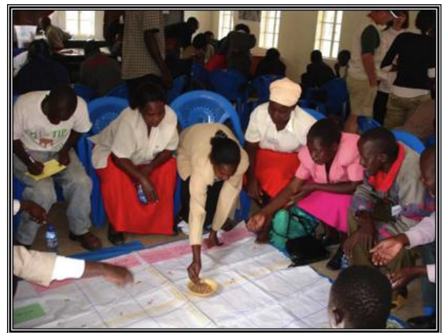
Community members workshop

Beginning with a "blank slate" of informal housing and slum dwellings – the community identified and subsequently mapped over 200 organizations and programs working on HIV/AIDS in the two villages alone.