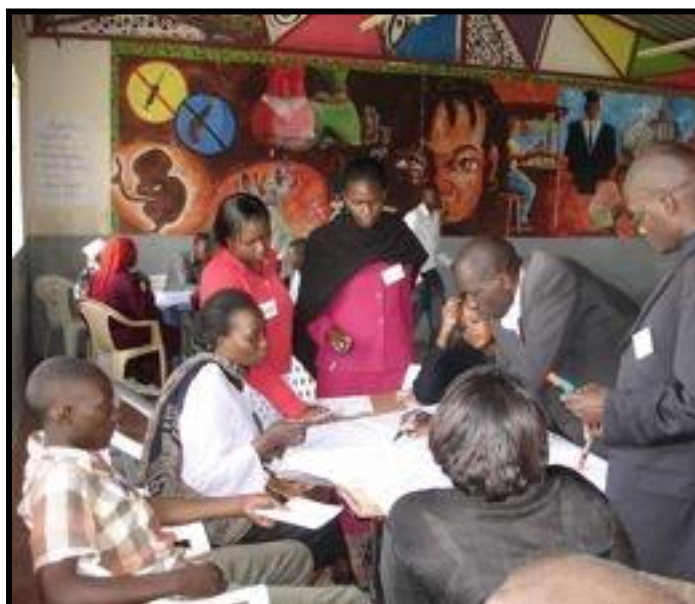
Workshop at Hope Worldwide